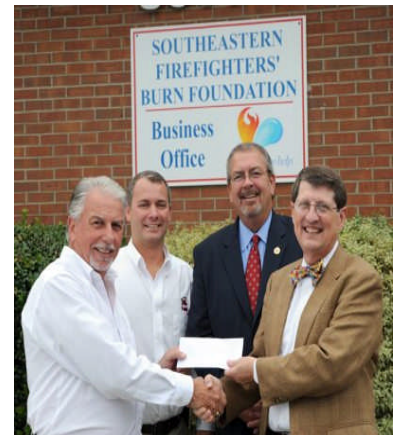
GAFSED Donates to Southeastern Firefighters Burn Foundation in Augusta.

In our first Board meeting of the year, we had several members, other than the Board present. These fellow members were there to get involved. I can not say how happy I am to know that others want to give of their