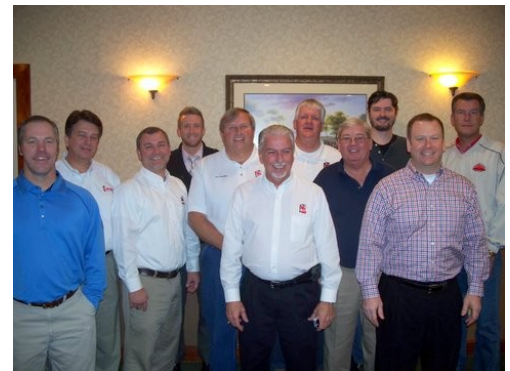
Your 2011 GAFSED Board of Directors